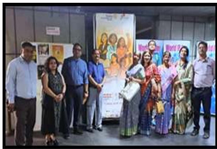
POST EVENT PHOTO SESSION