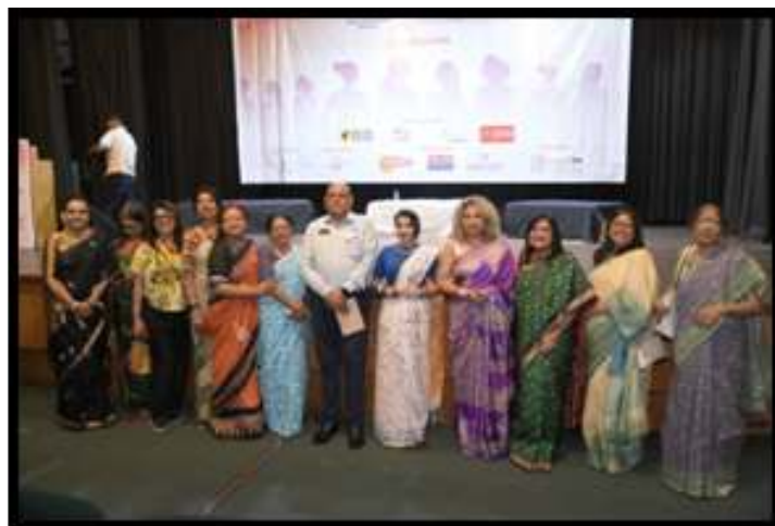
POST EVENT PHOTO SESSION